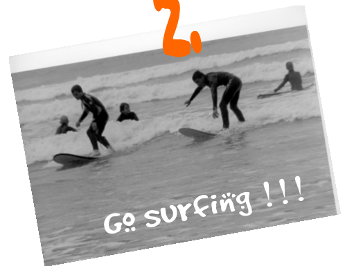
Go surfing !!!